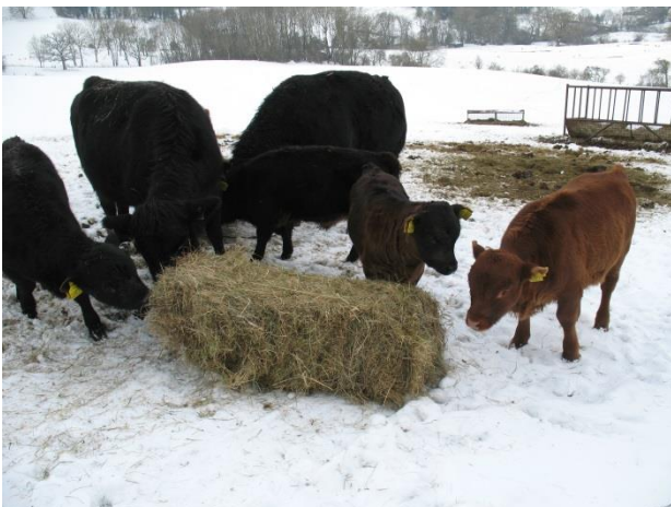
Mo, Crumble, Guy and Jessica in the snow

When the extensive grazing started in April 2012, the mood was very upbeat. The Dexter cows seemed to enjoy their new found 'freedom'. Of course there were a few hiccups to start with, such as people sometimes failing to latch gates securely and even deliberately blocking them open. We are pleased to report that such practices have abated! The latest problem regarding security has been with vehicles smashing through gates late at night.