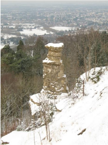
Devil's Chimney in a winter landscape

FOLK work parties are on the 2 nd Thursday the 3 rd Tuesday and the 4 th Sunday of each month dates for the next 6 months are printed below. You are always welcome to join us on one of our work parties, Tools are provided by FOLK and we start at 9.30, working for approximately 3hrs. For your own safety please wear stout footwear and tough gardening gloves. We meet at Tramway Cottage Car Park Daisy Bank Road at 9.30am.