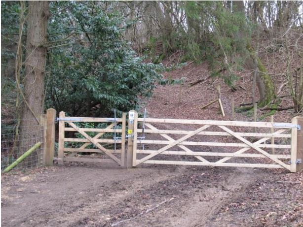
Replacement gate at the end of the Gallops

which has had to be replaced, there have been cases of the top wire rails on the boundary with the golf course being cut. This creates a gap for people to gain access to the hill without using the legitimate gates and stiles but it also allows the cattle to move off the Hill. If anybody sees this happening or spots vehicles where they shouldn't be please contact Wayne on, 01242 250019 or speak to the police.