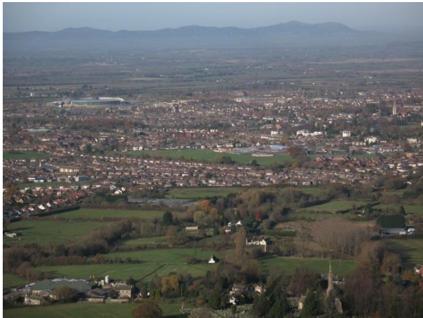
View from the top of the Hill

An options appraisal is being carried out by Cheltenham Borough on the unused Hill Farm buildings . The council are keen to dispose of the site for suitable use.