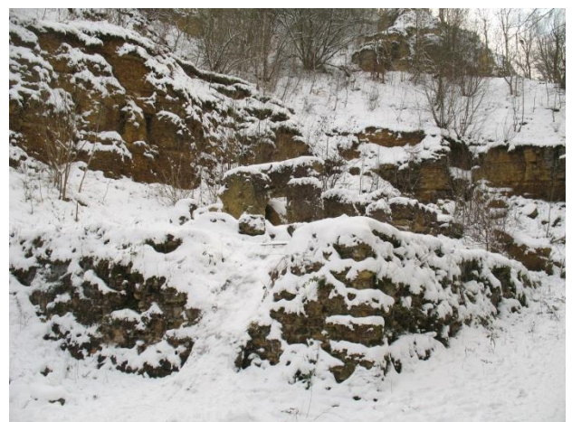
Snow covered Lime Kilns

Concern is growing over the condition of the Lime kilns and associated industrial archaeology on the Hill. These features are not listed as ancient monuments. The structural condition of the kilns needs to be established before restoration work can be planned. Advice has been sought from specialist historic building experts. Ecologists will need to be involved as well, because Natural England may have to license any work that could affect protected species living in the old quarries. This work will be expensive. The initial survey to decide what needs to be done may cost several thousands of pounds. Limited funds are available and a recent bid for grant funding was unsuccessful. Action must be taken soon if we are not to lose these important buildings. Further sources of funding are being actively investigated.