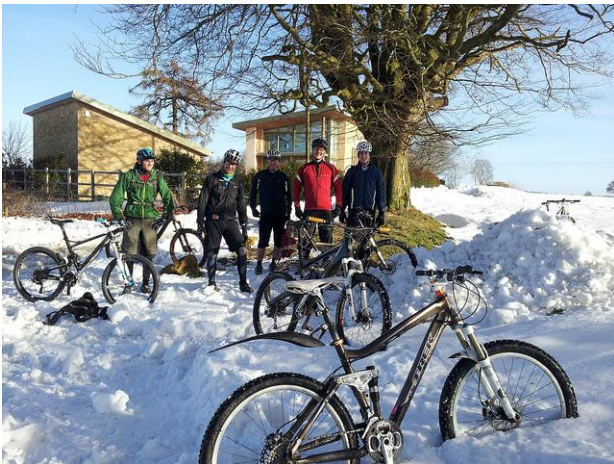
Mountain bikers enjoy the recent snow