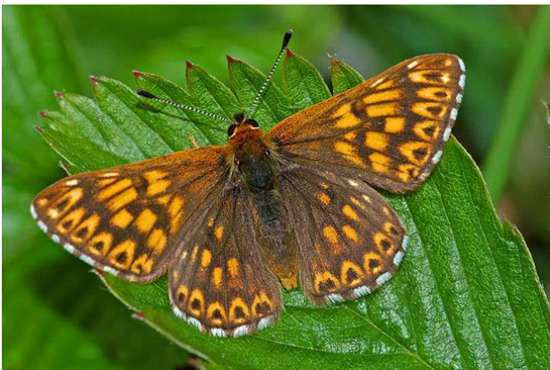
Duke of Burgundy butterfly

If you would like to help with this survey work, please get in touch with me to register your interest. I would hope to be able to pair up surveyors so that they can take it in turns to do their surveys, and provide mutual cover for holidays/other activities. Once I know the number of volunteers, the frequency of their commitment, and preferences as to the areas to be walked, I can decide which of the 3 types of survey would be the most appropriate to undertake.