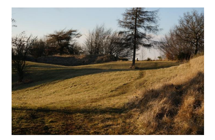
Part of our precious grassland on the Hill Fort

Preliminary discussions have taken place within FOLK and with the Cotswold AONB about whether the Hill and Common could be a suitable location for activities linked to the Magnificent Meadows Project. As a result there is a possibility that we might get involved in 2016 but much more planning and discussion of organisation will be needed in the meantime.