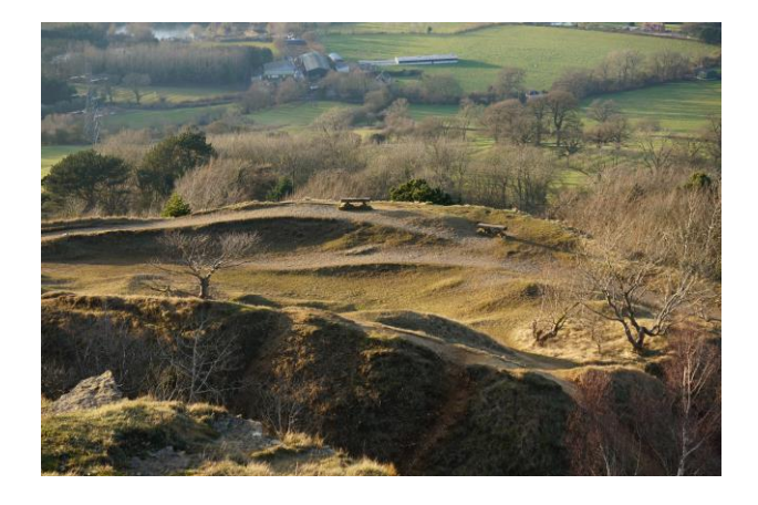
Former quarry on Leckhampton Hill

What aspect of the natural history, archaeology or geology of the Hill do you find most interesting? The industrial archaeology of the limestone workings, for example the standard gauge, tramways and winding wheels provide fascinating reminders of the past.