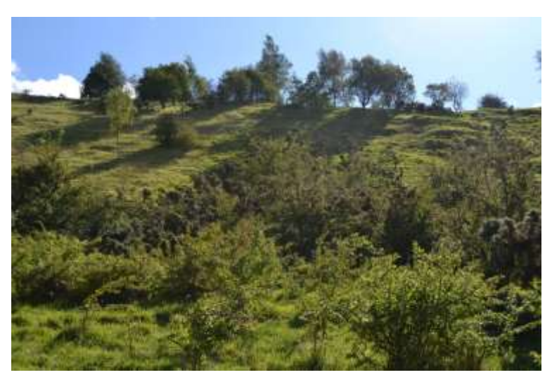
Tree growth on Charlton Kings Common

Several members of FOLK have recently agreed with me that seedlings of Ash are very abundant this year. At least this is the case in my garden and I assume therefore on the Hill and the Common. Invading Ash is one of the significant management issues on our site, as individuals of the species become established very rapidly