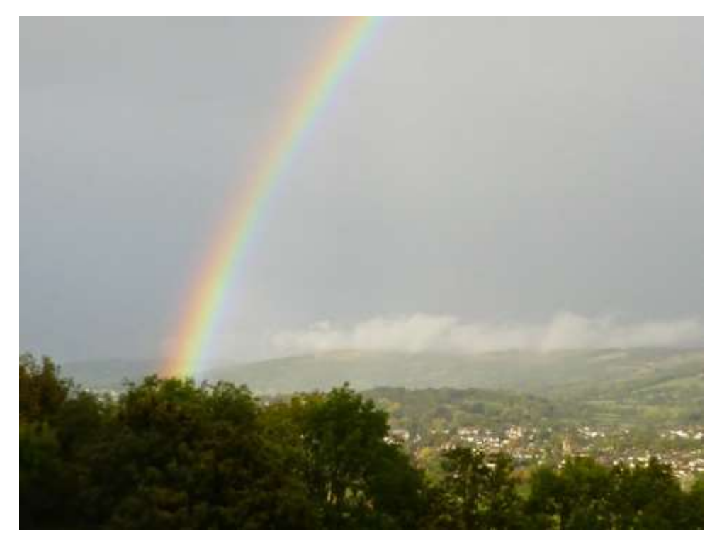
Rainbow over Cheltenham.