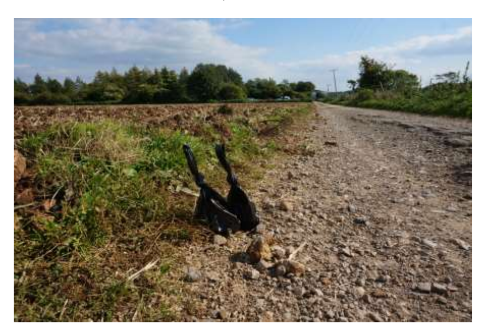
Mysterious deposited black bags near Brownstones car park

As a footnote to the comment on litter in Word from Wayne, there continues to be a mystery about why dog owners leave bags of dog waste on footpaths and hanging in bushes. Does anybody know why this strange and unpleasant habit has taken hold. Answers on a postcard.