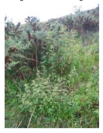
Hemp Agrimony friend or foe?

It turns out that I was a bit optimistic in the last newsletter when I said that there appeared to be little sign of the troublesome weed Hemp Agrimony this season. As it happens it was just a little late growing this year and we ended up spending 4 work parties during July and August pulling it up. However, it certainly wasn't in such dense patches as previous years and was rather patchy and more thinly spread. Also the growth wasn't as strong and there were signs that it was being grazed by the cattle whereas in previous years it was hardly