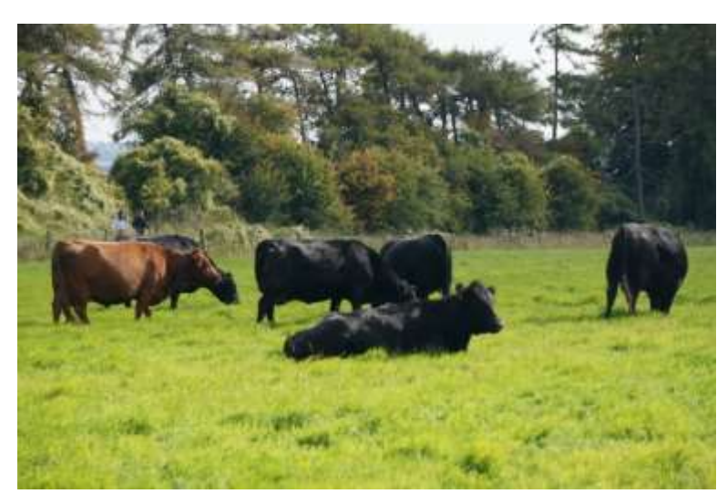
Expectant mums in arable reversion field

2016 is the half way point in the Higher Level Stewardship scheme, which the Council operates on the Common. Grazing is a crucial part of the management. It is going well with the herd size being effectively at a sustainable level although there is always more to learn about how the herd plays its part in management of