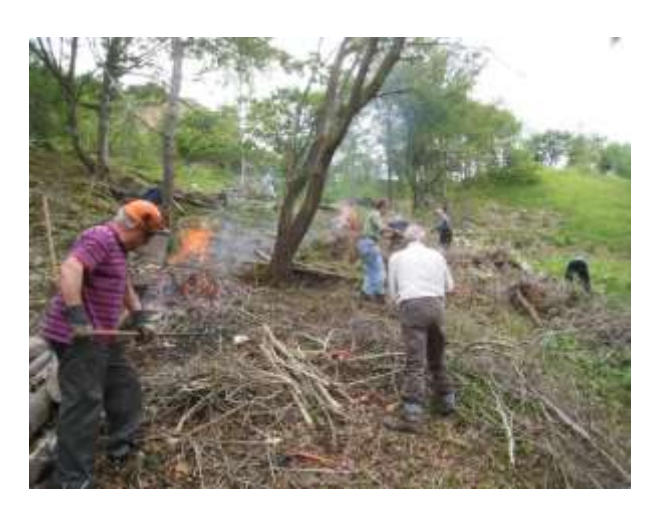
Clearance work around the Lime Kilns