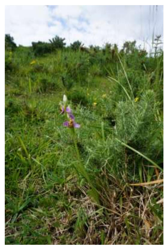
Bee orchid in grazed area with gorse re-growth

field hedges, are always a shock and a challenge in several ways. Not only is there the issue of whether or not we attempt to stop the change, but at another level it makes us address the question of what range of species we want in the countryside. This latter question may not be easy to answer. I have recently been shown photographs of our site from various dates in the past 100 years. One thing that this series of snapshots show is how much the vegetation of our site has changed over this period, from one with virtually no trees, to one where Gorse was one of the main species, to the present situation where management, including the recent clearance of trees and scrub from parts of Leckhampton Hill, has replaced woody species by grassland. Which point in recent time would be the best model for the future? Over a much longer time frame, a recent study in the Swiss Alps has shown that the activities of Neolithic people between 5000 and 7000 years ago resulted in major changes in the tree populations of high level woodlands, especially the irreversible decline of European Silver Fir. This loss is not only of historical interest because, at the altitudes involved, Silver Fir is predicted to be better able to withstand the effects of the coming climate change than is the Norway Spruce that has replaced it.