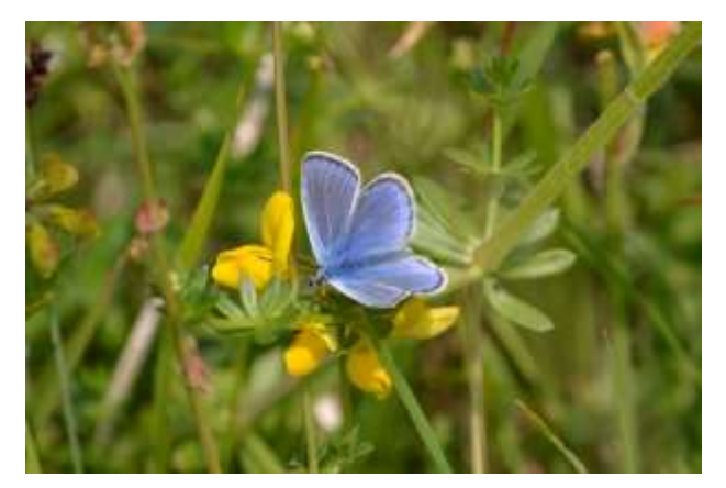
Common Blue butterfly

this area, and a visit the following week lived up to expectations!