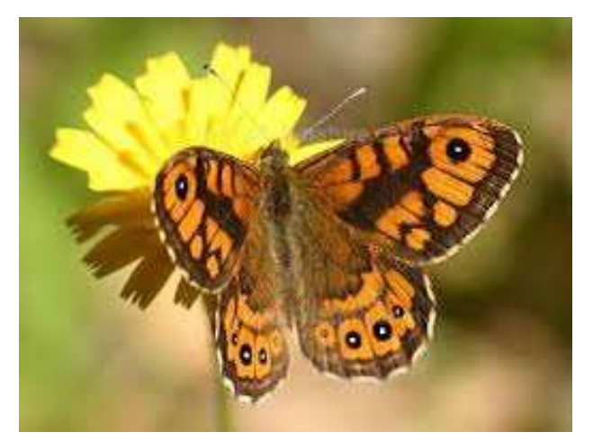
Wall Brown butterfly image from the internet

restricted to the west facing slope of Leckhampton Hill, but were never seen in large numbers so their continued presence there is a cause for concern. They appear to have been lost from the other site on the lower slopes of the western end of Charlton Kings Common, not having been seen there for several years despite intensive searches. It was good to see the Silver-washed Fritillaries again flying over the woodland edge alongside the grassy area above the Bridge car park on Daisybank Road and this year they made it over the beech wood and were spotted on the Charlton Kings Common side close to the pond. Dark Green Fritillaries were widespread in low numbers. It was interesting that the greatest number recorded in one section this year were outside the original survey area, but still on land owned by Cheltenham Borough Council. A ragwort pulling work party in Hopkins field in wet conditions drew my attention to the potential of